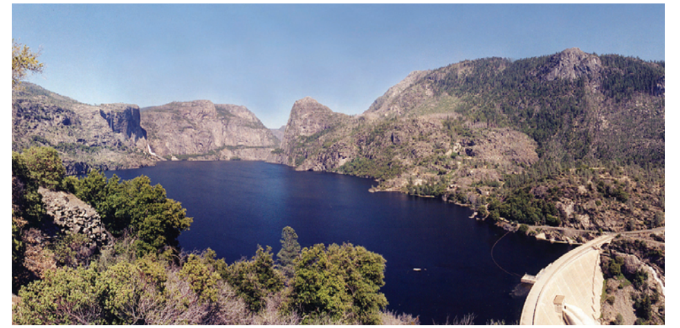
The eight mile long Hetch Hetchy Reservoir and O'Shaughnessy Dam as seen today

The first phase of construction on the O'Shaughnessy Dam (named for the chief engineer) was completed in 1923 and the final phase, raising the height of the dam, was completed in 1938. Today the 117-billion-gallon reservoir supplies pristine drinking water to 2.4 million Bay Area residents and industrial users. It also supplies hydro-electric power generated by two plants downstream. The reservoir is eight miles long and the largest single body of water in Yosemite.